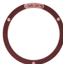
Type 41245A Diffuser Frame