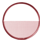
Type 4098S Half Single Moledura Scrim