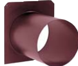
Type 40913 Snoot