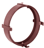
Type 4095 Accessory Holder