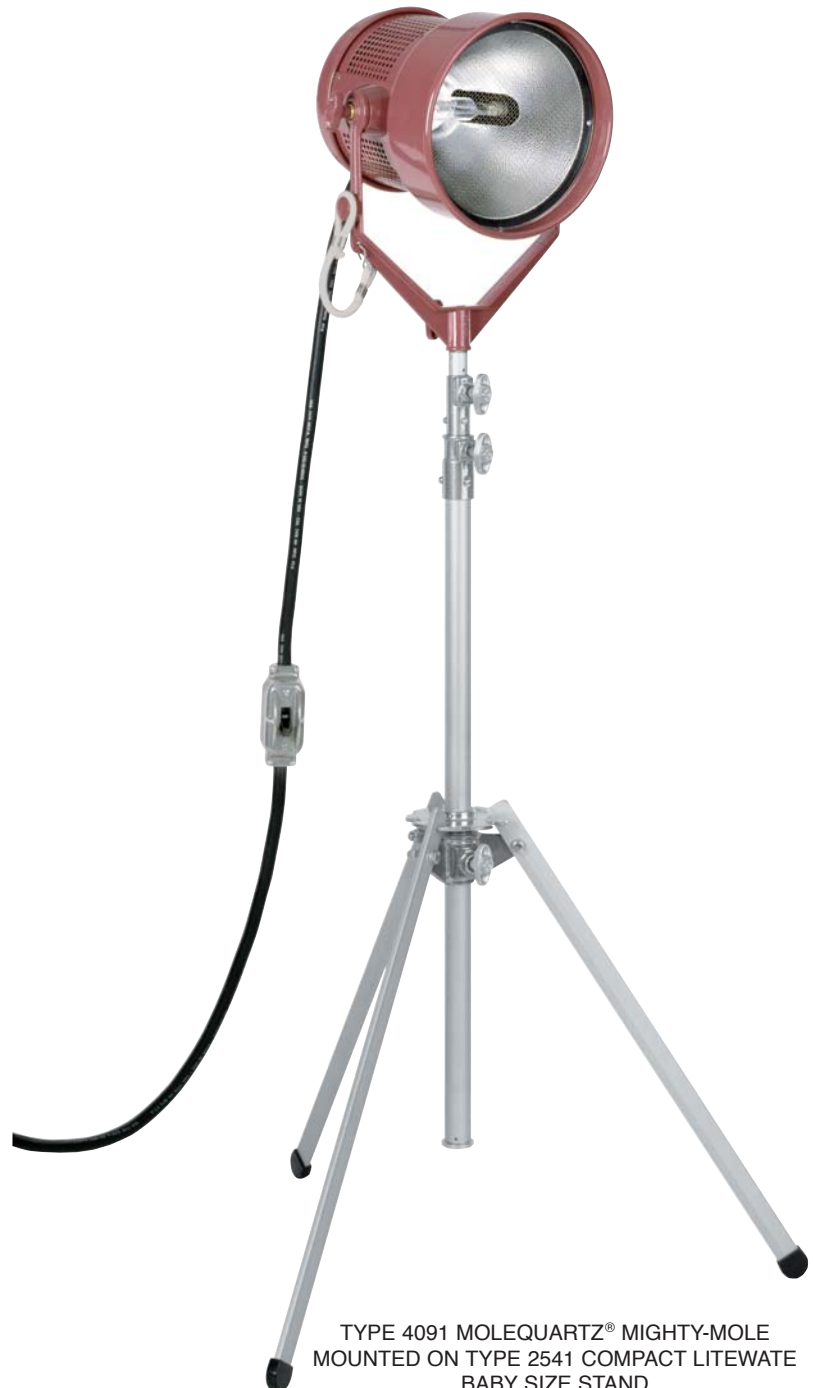
TYPE 4091 MOLEQUARTZ® MIGHTY-MOLE MOUNTED ON TYPE 2541 COMPACT LITEWATE BABY SIZE STAND

Compact, focusable tungsten-halogen quartz fixture provides high intensity in a small package. For use in TV news coverage, and TV Film commercials as well as Motion Picture and Industrial films. Excellent for use in small TV studios or stages in schools and universities. Available in kits for ease in transporting by car, truck, or airplane. Extremely smooth, flat field in all positions from spot-to-flood. Uses special Aluminum Molebrite® Alzak Reflector. For use with 2,000 watt, 3200°K quartz globe. Equipped with safety screen.