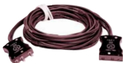
Type 5001652 60 Amp Extension Cable—25 ft.