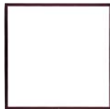
Type 419367 Diffuser Frame