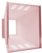
Type 419355 Molecone