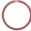
Type 419103 Moledisc Diffuser Frame