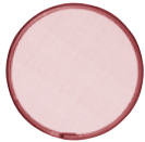
Type 419109D Moledura Scrim